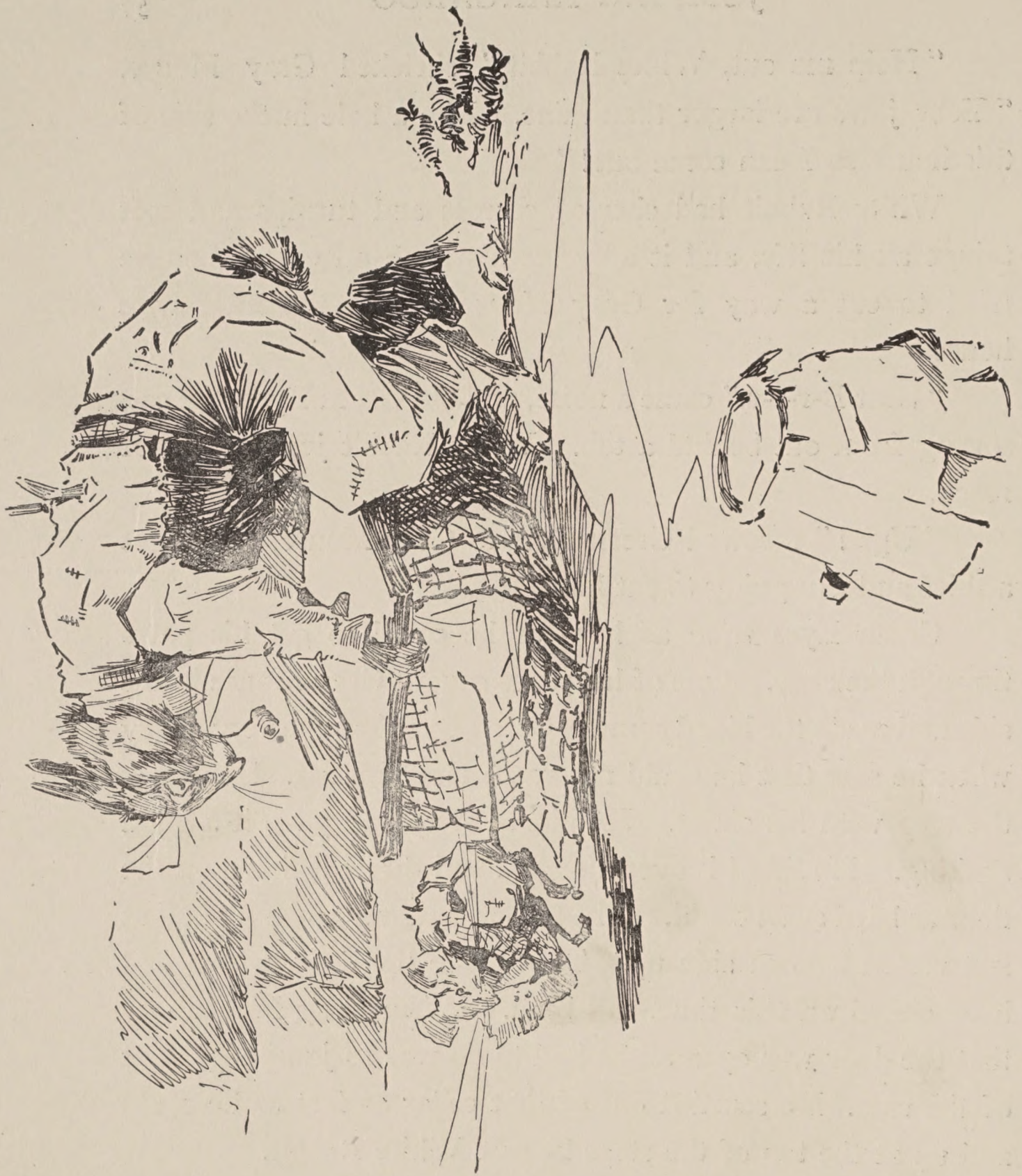
WHITE RABBIT TURNS OVER THE TRAP.